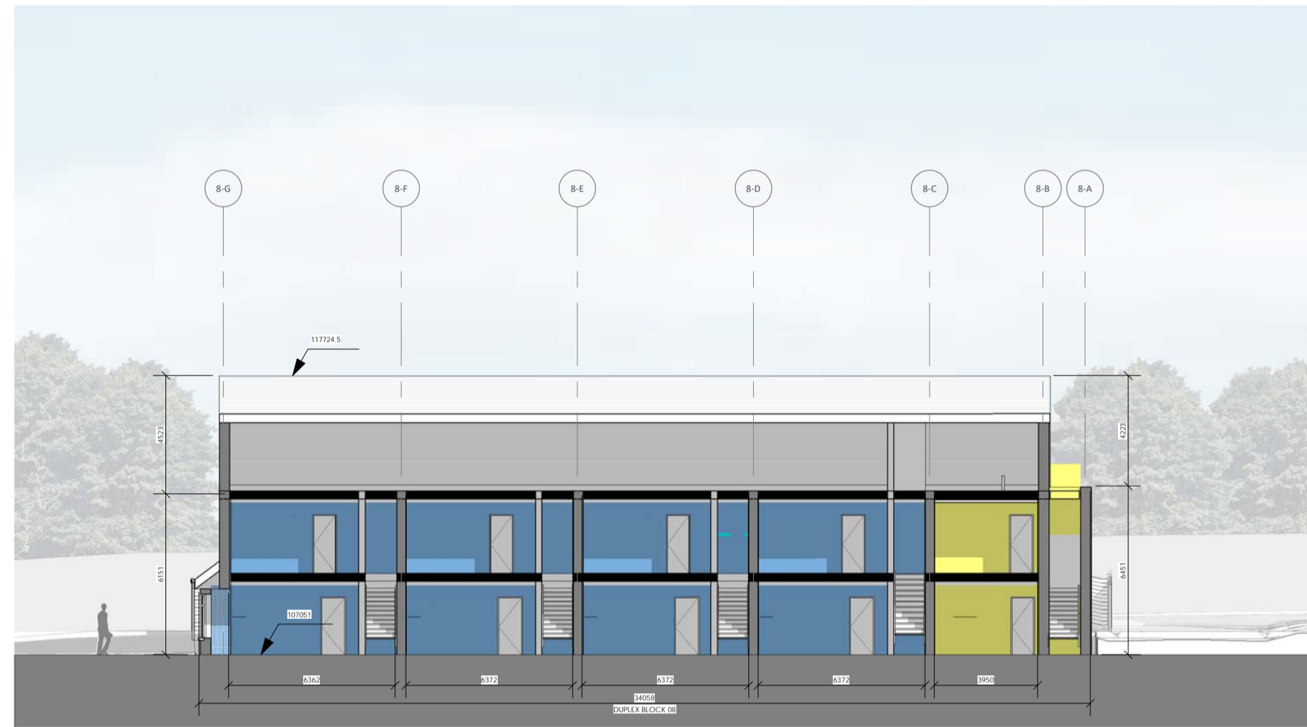
1 Duplex Block 08_Long Section 1:200