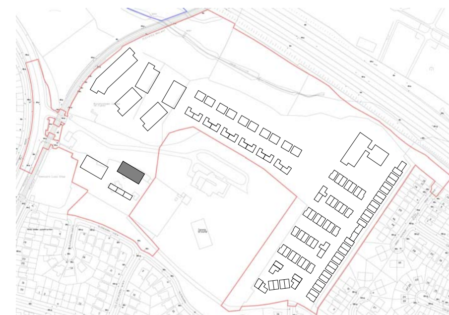
SITE KEY PLAN