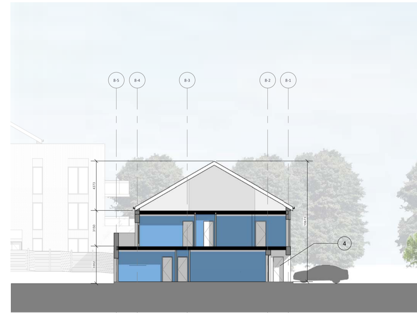
2 Duplex Block 08_Short Section 1:200