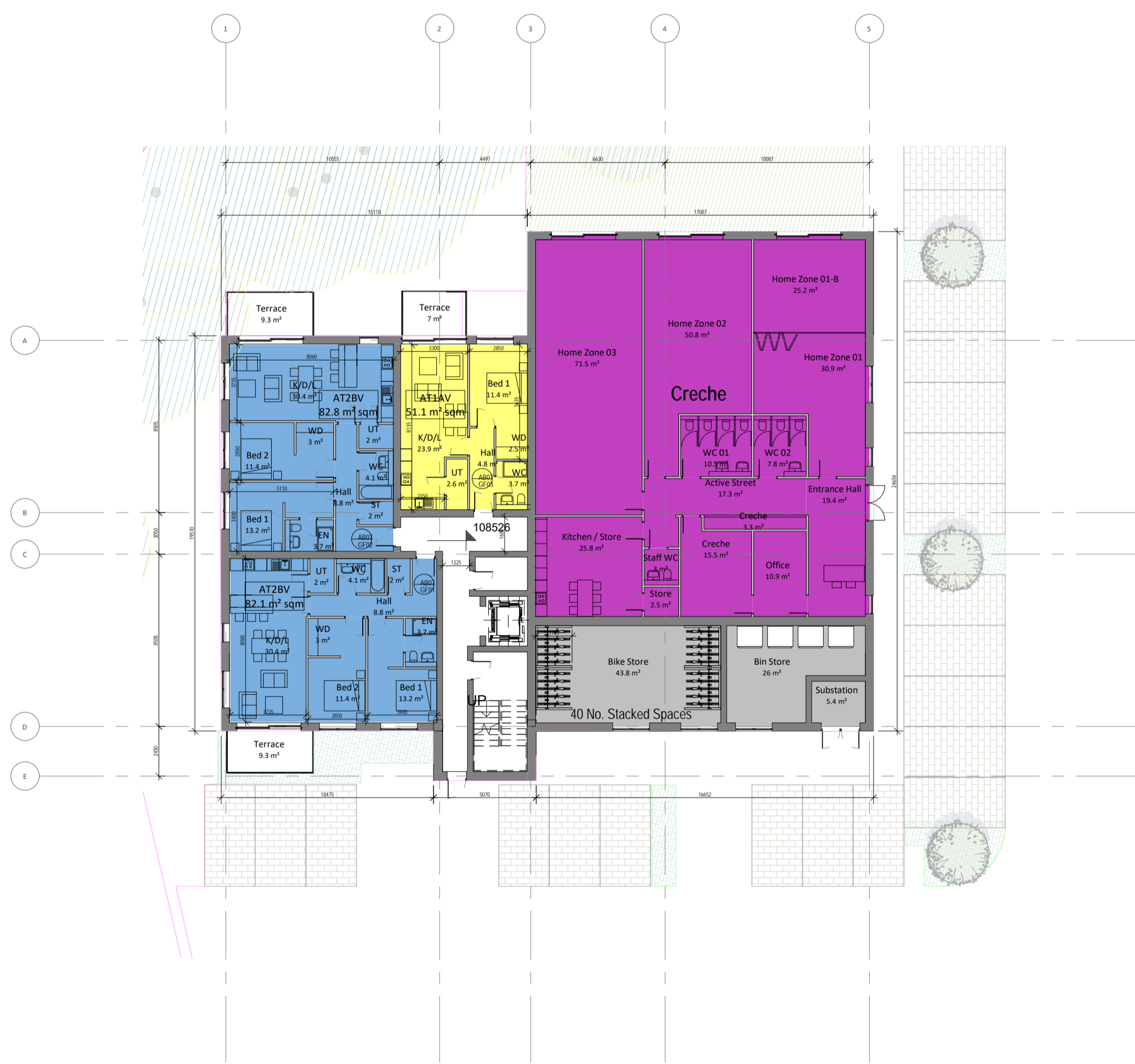
Apartment Block 07 Ground Floor Plan

NOTE 01 - Total Storage to include Wardrobes (WD) and Utility (UT)