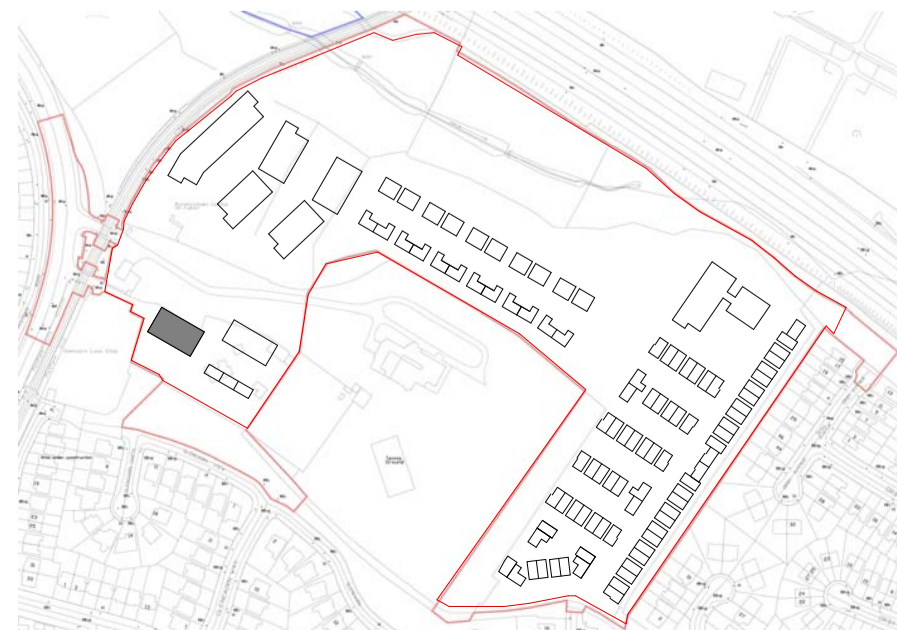
SITE KEY PLAN

NOTE 01 - Total Storage to include Wardrobes (WD) and Utility (UT)