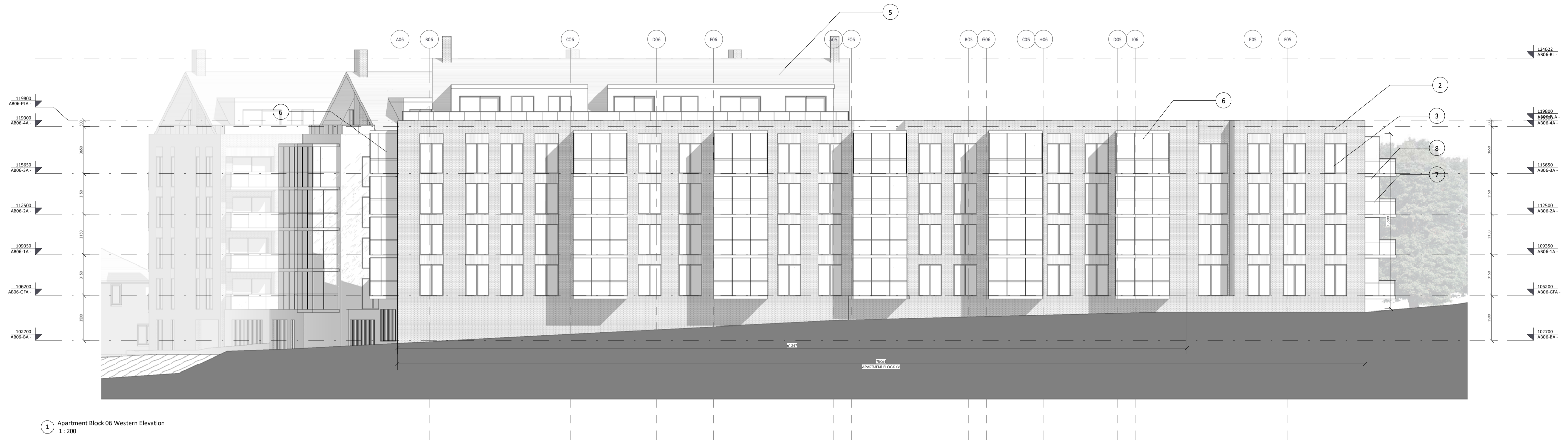
1 Apartment Block 06 Western Elevation 1:200