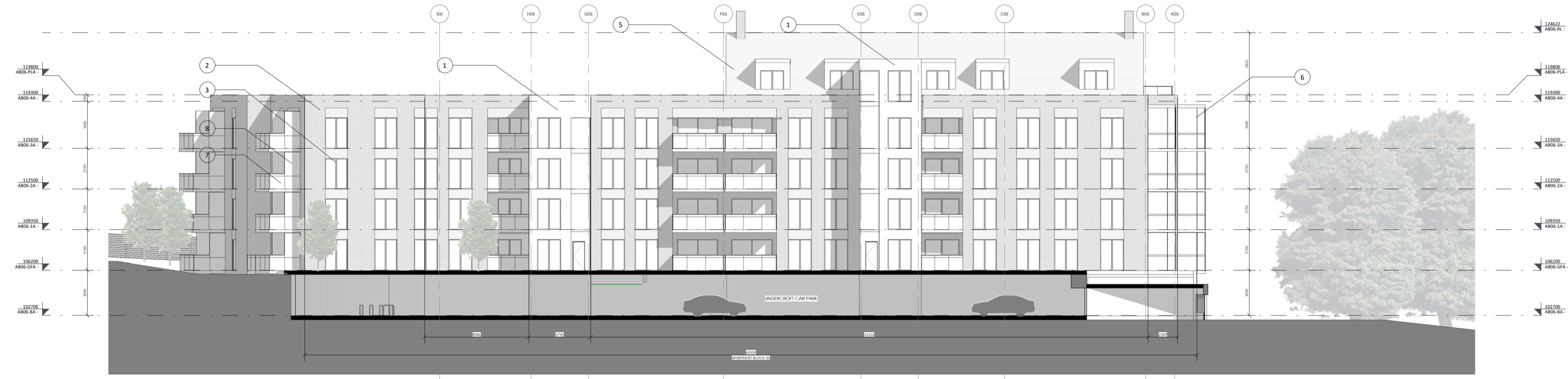
2 Apartment Block 06 Eastern Elevation 1:200