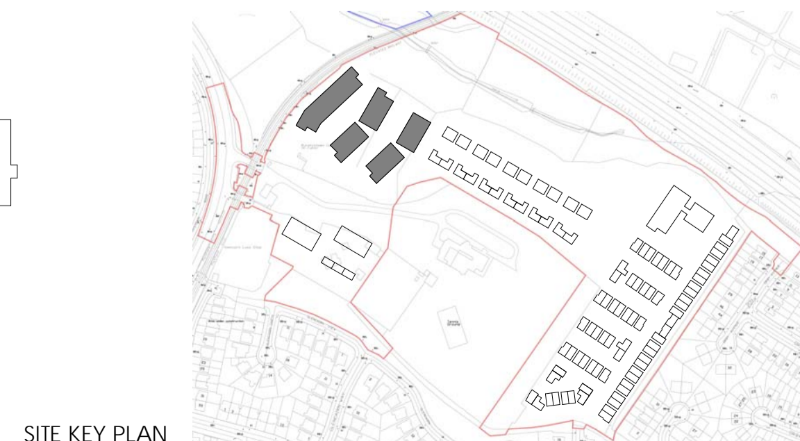
SITE KEY PLAN