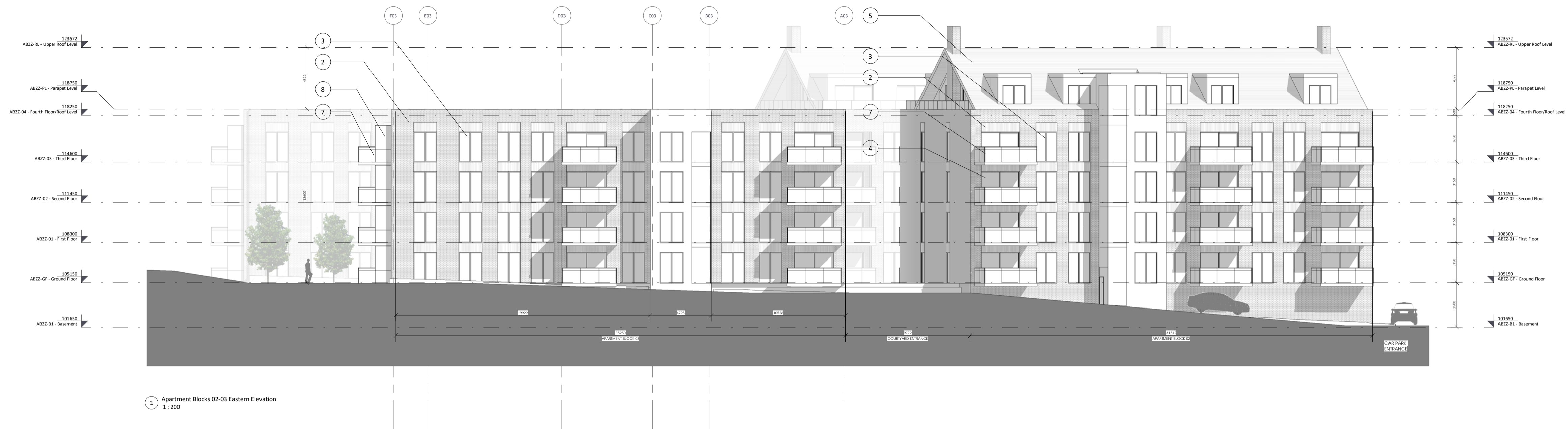
1 Apartment Blocks 02-03 Eastern Elevation 1:200