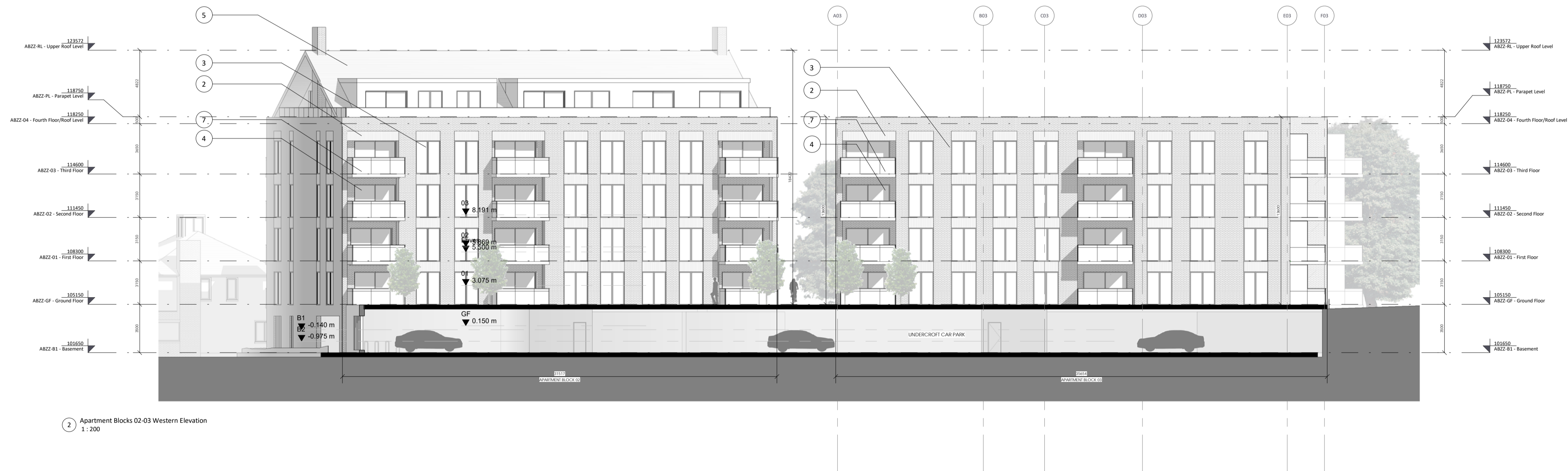
2 Apartment Blocks 02-03 Western Elevation 1:200