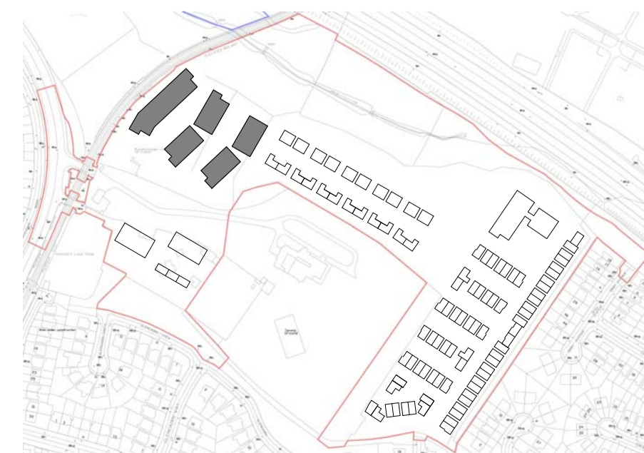
SITE KEY PLAN