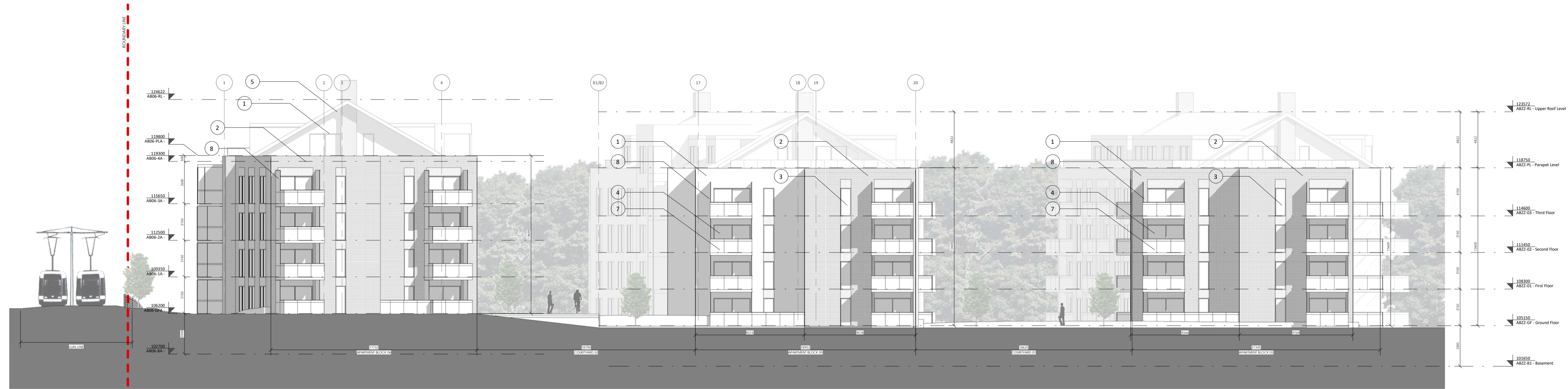
1 Apartment Blocks 02-06 Southern Elevation 1:200