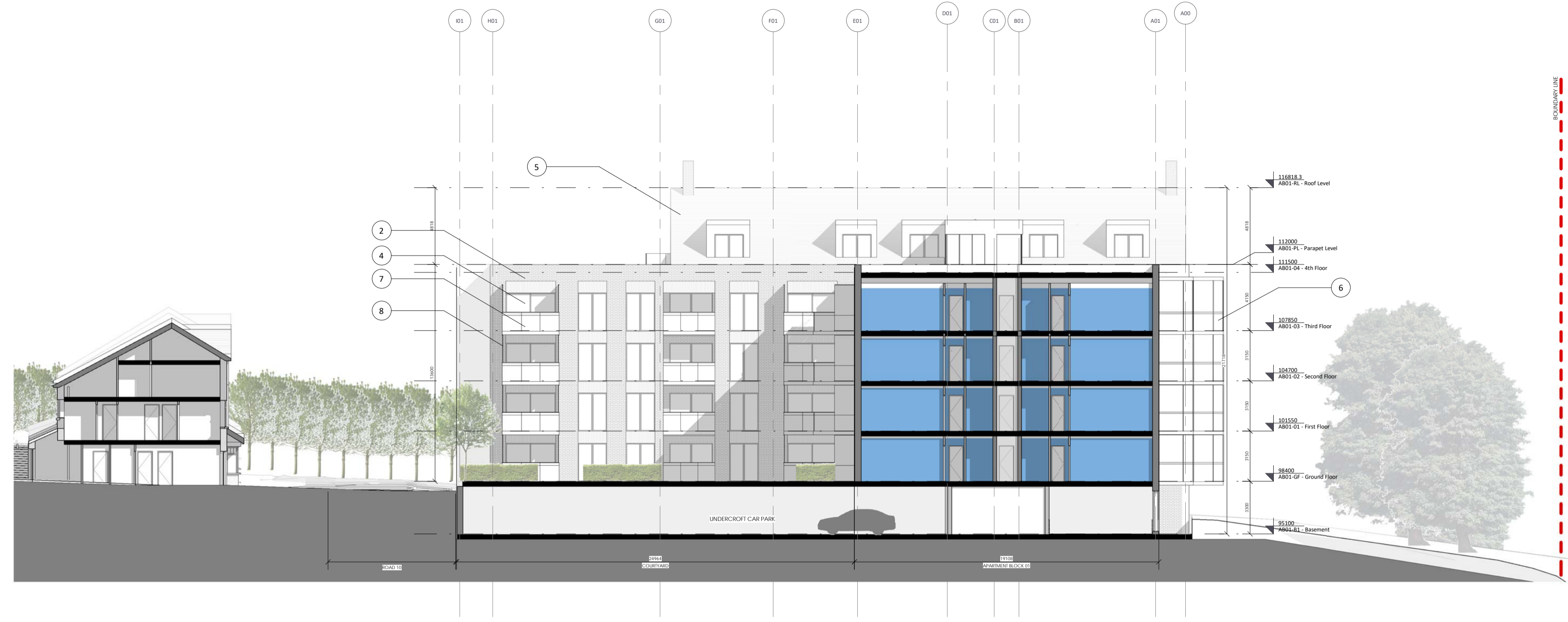
1 Apartment Block 01 Section A-A 1:200