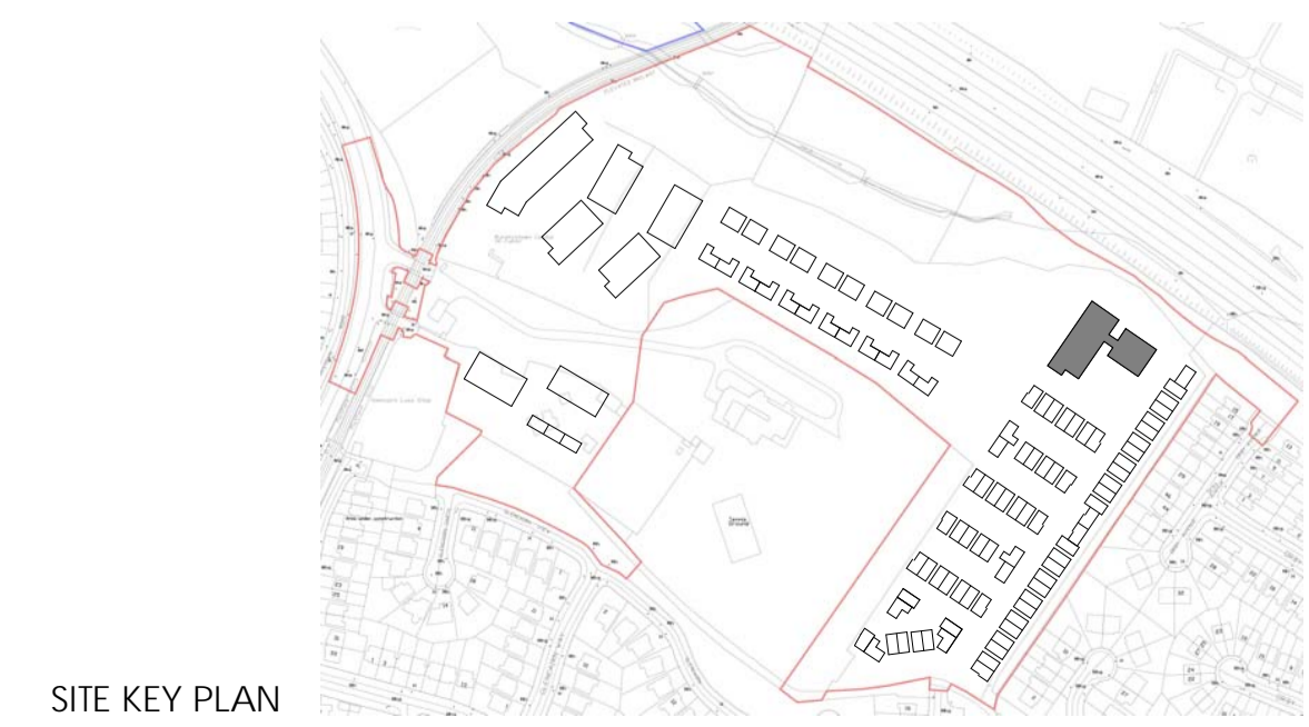
SITE KEY PLAN