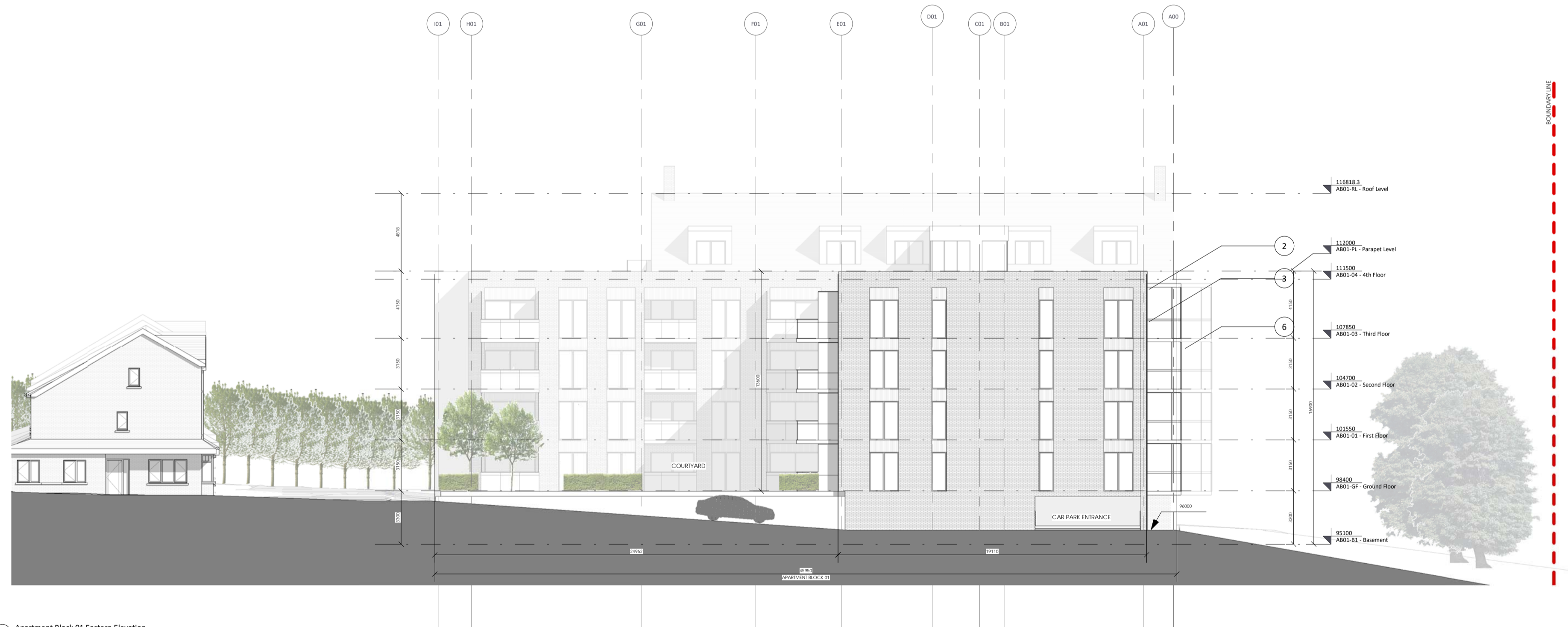
2 Apartment Block 01 Eastern Elevation 1:200