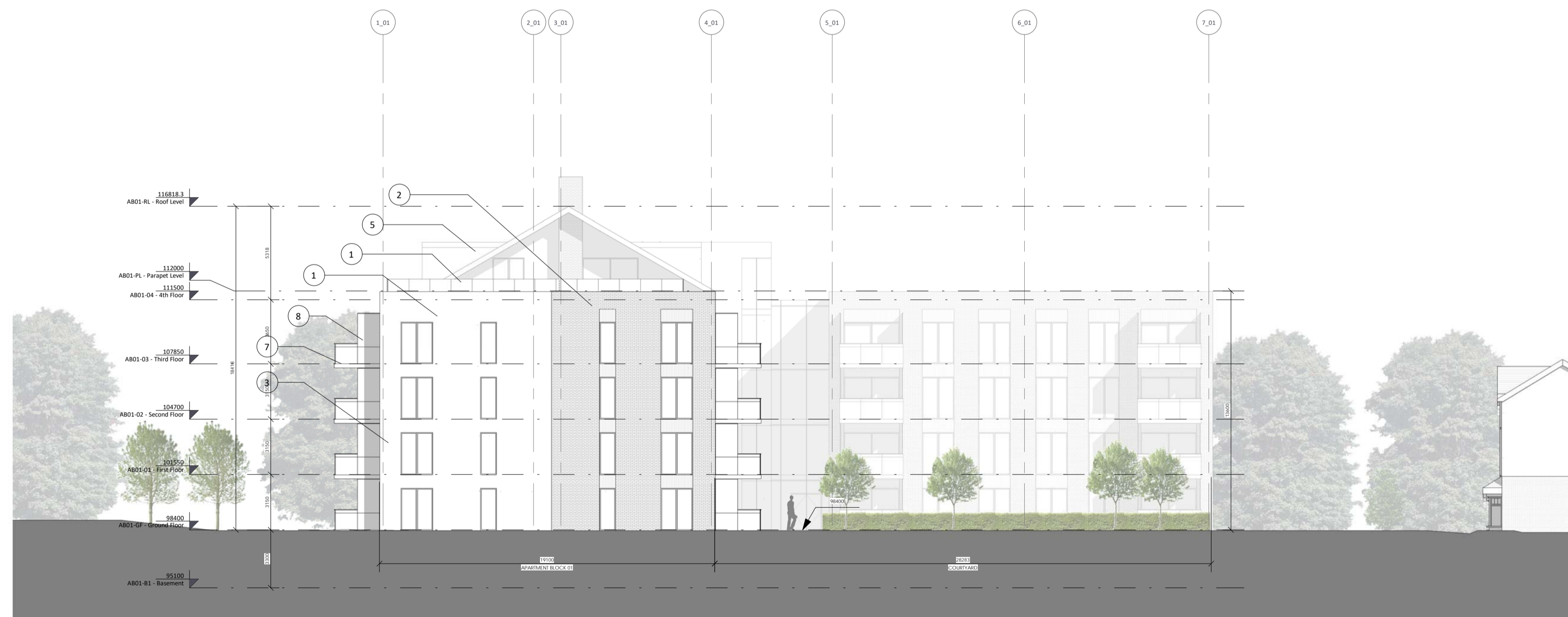
2 Apartment Block 01 Southern Elevation 1:200