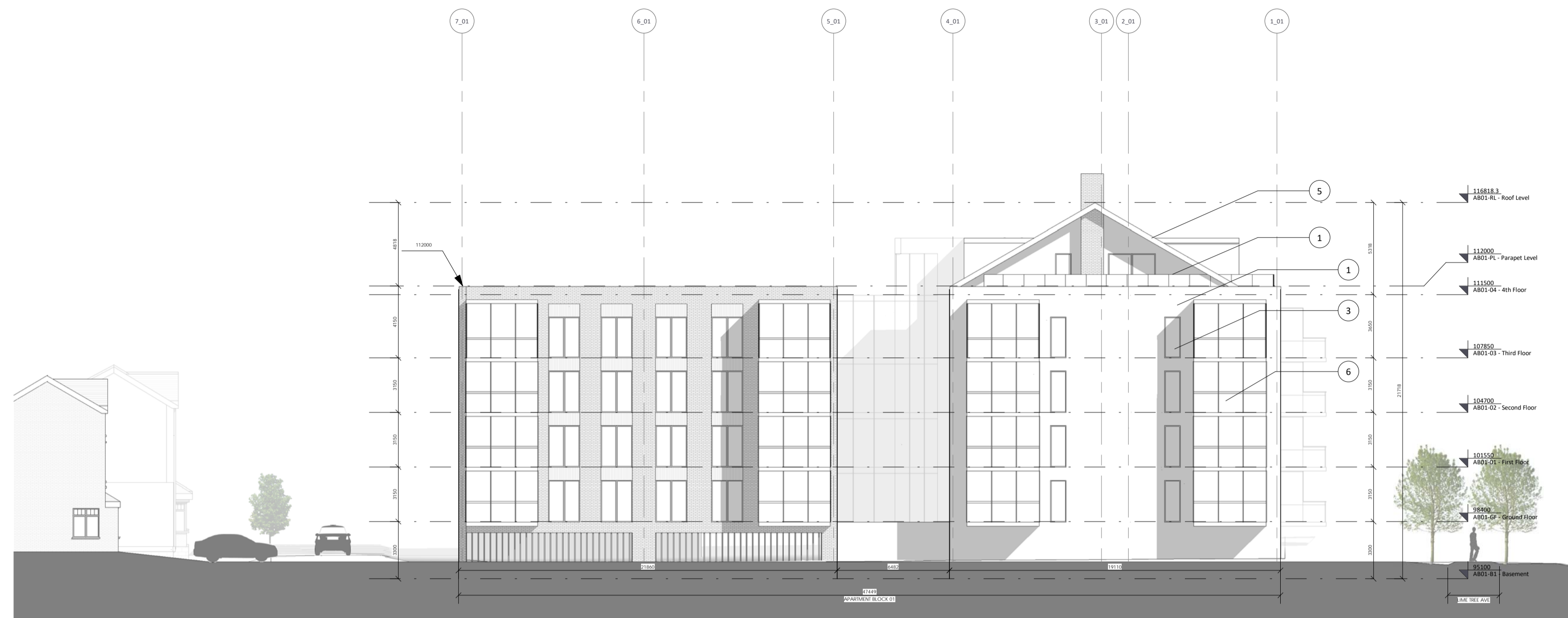
1 Apartment Block 01 Northern Elevation 1:200