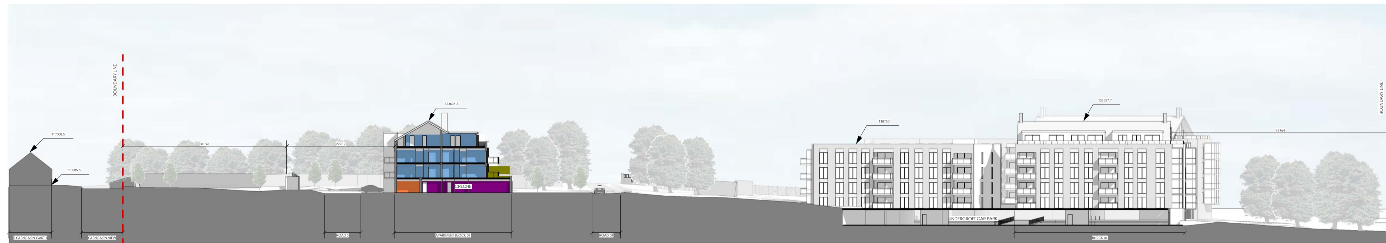
2 SITE SECTION B-B 1:500