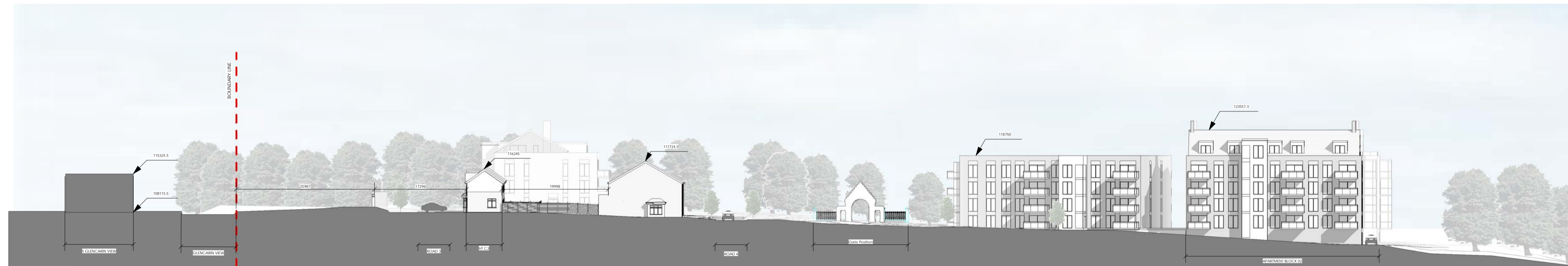
3 SITE SECTION C-C 1:500