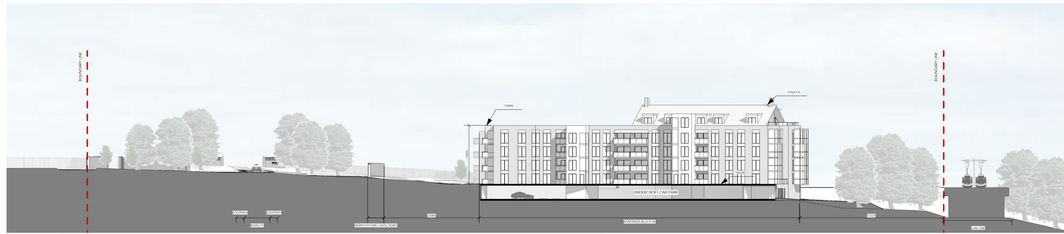
1 SITE SECTION A-A 1:500